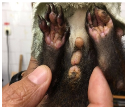
Fig. 1. Clinical aspects – edema, exudation and crusting of the pads, penal, scrotal and anal area

The squirrel youngsters were fed with cat milk substitutes for the following five weeks after being recovered. Crusty nodules appeared on the lids, ears and on the dorsal sacral region, disseminating on the entire body over another week. Edema of the ears, pads, anus and genitals was seen shortly after, accompanied by exudation and hair loss in the lesion sites (Fig. 1, 2, 3)....(Text – Arial 10, paragraph alignment – Justify, with Indentation for the first line – 1.25 cm, followed by a space of Arial 10)